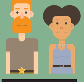
Dave & Tina Injured - are they properly insured?